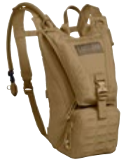
1723201000 COYOTE NIR