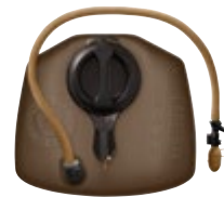
2052001003 3L LUMBAR / 100 OZ