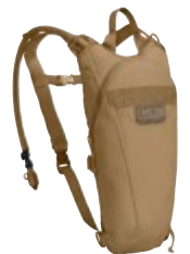
1717201000 COYOTE NIR