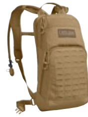
1742201000 COYOTE NIR