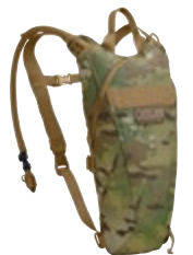
1718901000 MULTICAM® NIR