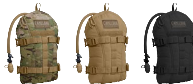
1726901000 MULTICAM® NIR 1862201000 COYOTE NIR 2850001000 BLACK

*BECAUSE EACH PACK IS INDIVIDUALLY SEWN THERE IS A TOLERANCE OF ± 3% FOR PACK WEIGHT