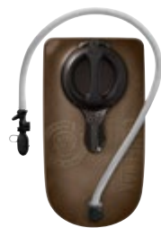
2177001085 2.5L / 85 OZ