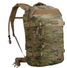
1740901000 MULTICAM® NIR