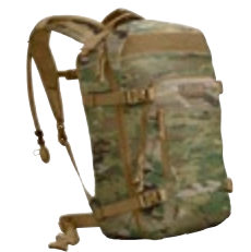
1732901000 MULTICAM® NIR