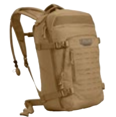
1731201000 COYOTE NIR