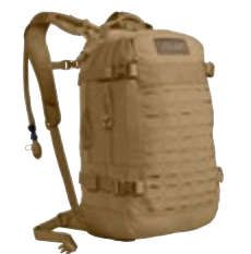
1734201000 COYOTE NIR