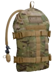
1726901000 MULTICAM® NIR