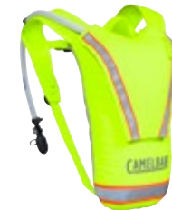
1736702000 LIME GREEN