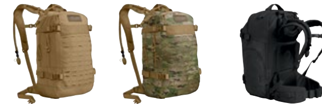
1734201000 COYOTE NIR 1735901000 MULTICAM® NIR

3L : 100 oz MIL SPEC CRUX® LONG RESERVOIR