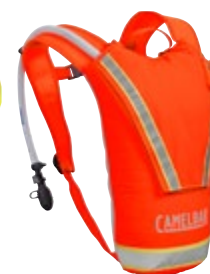
1736801000 INTL' ORANGE