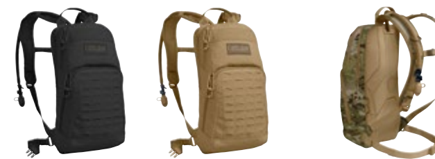
1741001000 BLACK 1742201000 COYOTE NIR

3L : 100 oz MIL SPEC CRUX® LONG RESERVOIR