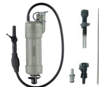
91193 4610-01-699-8815 NSN M.A.P.S. Purifier-IWTD includes adapters and components for purifier use with US Army MOLLE reservoirs and 1 qt canteens