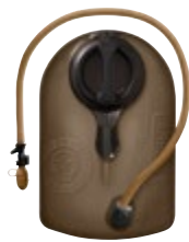
2023001003 3L SHORT / 100 OZ