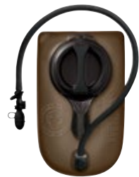
2053001015 1.5L / 50 OZ