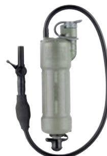
91187 M.A.P.S. Purifier for use with CRUX and Antidote Reservoirs