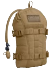
1862201000 COYOTE NIR