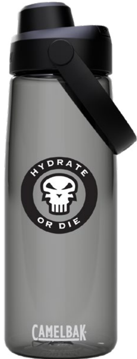
2926002075 CHARCOAL HOD