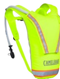
1736702000 LIME GREEN

*BECAUSE EACH PACK IS INDIVIDUALLY SEWN THERE IS A TOLERANCE OF ± 3% FOR PACK WEIGHT