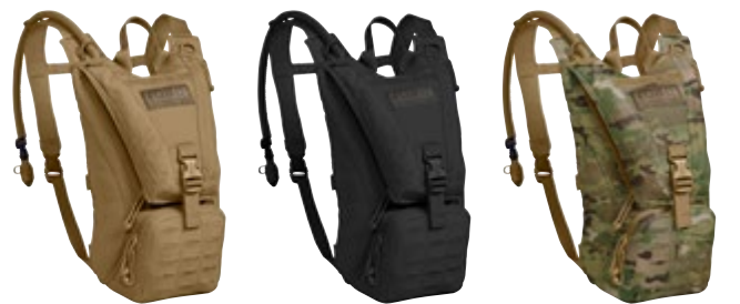
1723201000 COYOTE NIR 1722001000 BLACK 1724901000 MULTICAM® NIR

*BECAUSE EACH PACK IS INDIVIDUALLY SEWN THERE IS A TOLERANCE OF ± 3% FOR PACK WEIGHT