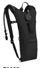
71000 8465-01-396-9917 NSN BLACK