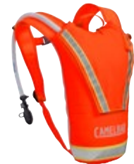
1736801000 INTL' ORANGE