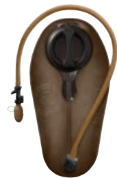
1944001003 3L LONG / 100 OZ