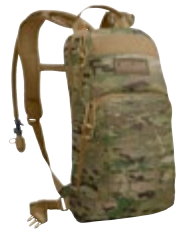
1743901000 MULTICAM® NIR