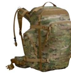
1729901000 MULTICAM® NIR