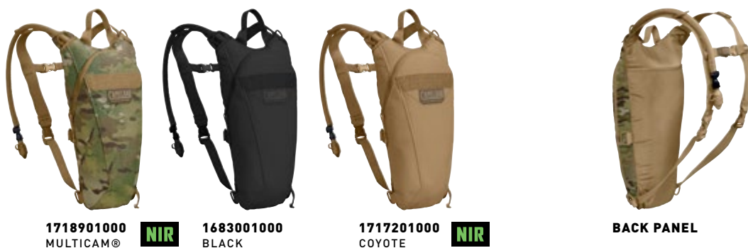
1718901000 MULTICAM® NIR 1683001000 BLACK 1717201000 COYOTE NIR BACK PANEL

*BECAUSE EACH PACK IS INDIVIDUALLY SEWN THERE IS A TOLERANCE OF ± 3% FOR PACK WEIGHT