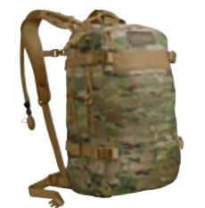
1735901000 MULTICAM® NIR