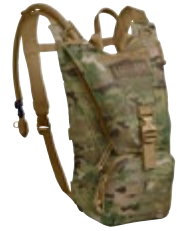
1724901000 MULTICAM® NIR