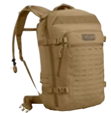
1739201000 COYOTE NIR