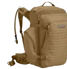
1728201000 COYOTE NIR