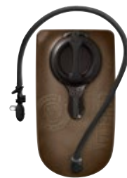
2024001085 2.5L / 85 OZ