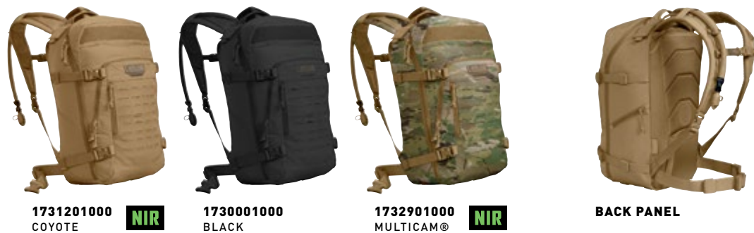
1731201000 COYOTE NIR 1730001000 BLACK 1732901000 MULTICAM® NIR BACK PANEL

*BECAUSE EACH PACK IS INDIVIDUALLY SEWN THERE IS A TOLERANCE OF ± 3% FOR PACK WEIGHT