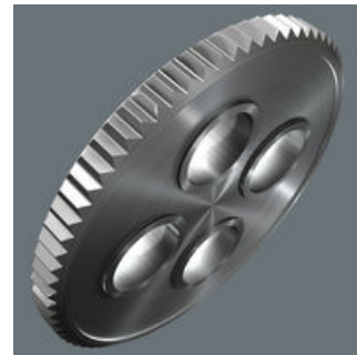
The fine tooth mechanism, with its 60 teeth, allows a small return angle of only 6° - ideal for precision work.