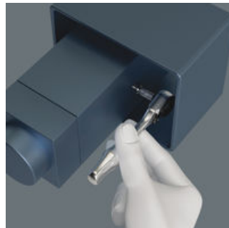
For all difficult-to-access applications.