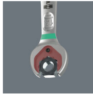
Joker 6000 ring ratchet spanner

The Joker's holding function means that nuts and bolts can be held in the jaw and easily positioned where they are needed. Fastening on to the thread can then be done quickly and safely, thanks to the innovative special stop-plate which holds the fastener. No more time-wasting searches for dropped nuts and bolts! After applying and positioning the nut or bolt, fastening can begin immediately - no additional tools required.