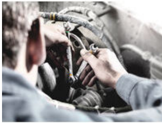
Joker open-ended wrench

The ratcheting feature at the ring end boasts an exceptional, fine tooth mechanism - 80 teeth in all - which provides greater flexibility, even in very confined working spaces.