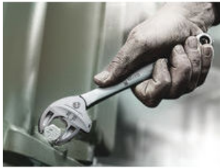
Joker 6004: automatically and continuously self-setting