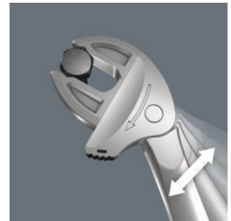
Joker 6004: Ratchet mechanism for quick working

The ratchet feature in the jaw ensures fast and consistent screwdriving without removing the tool.