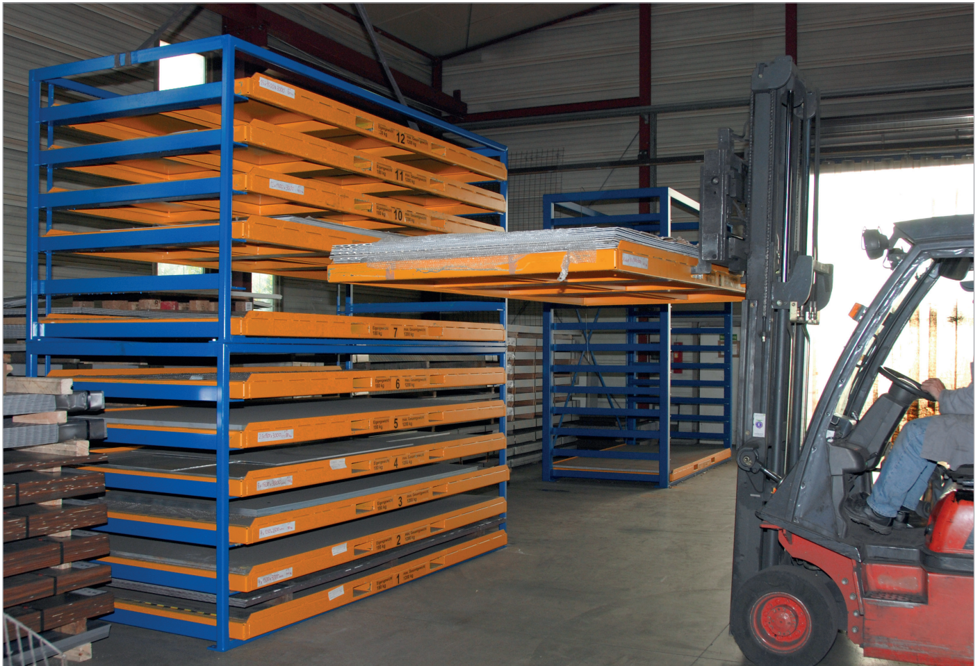
KBR 3 - stacked twice